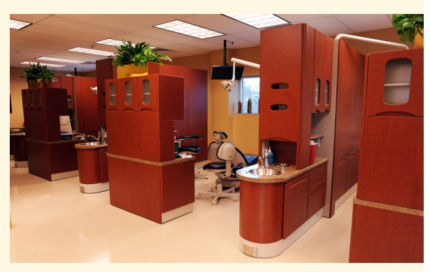
UCF Student Health Services' in-house dental facility

All other services are provided at the UCF Student discounted rate.